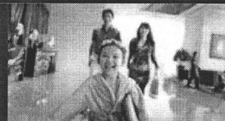
Walt Disney World Resort